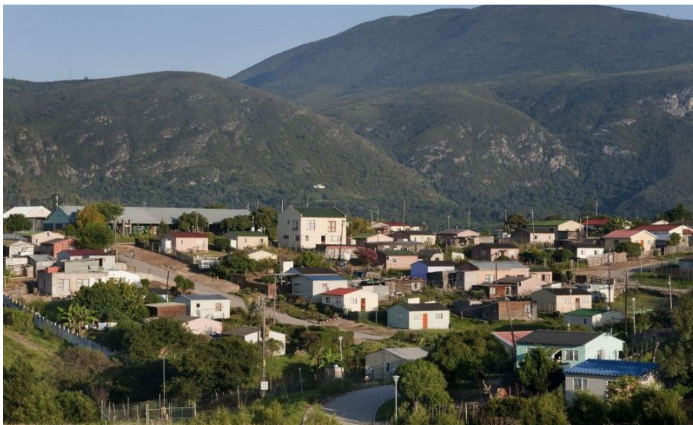
A snapshot of Touwsrante.